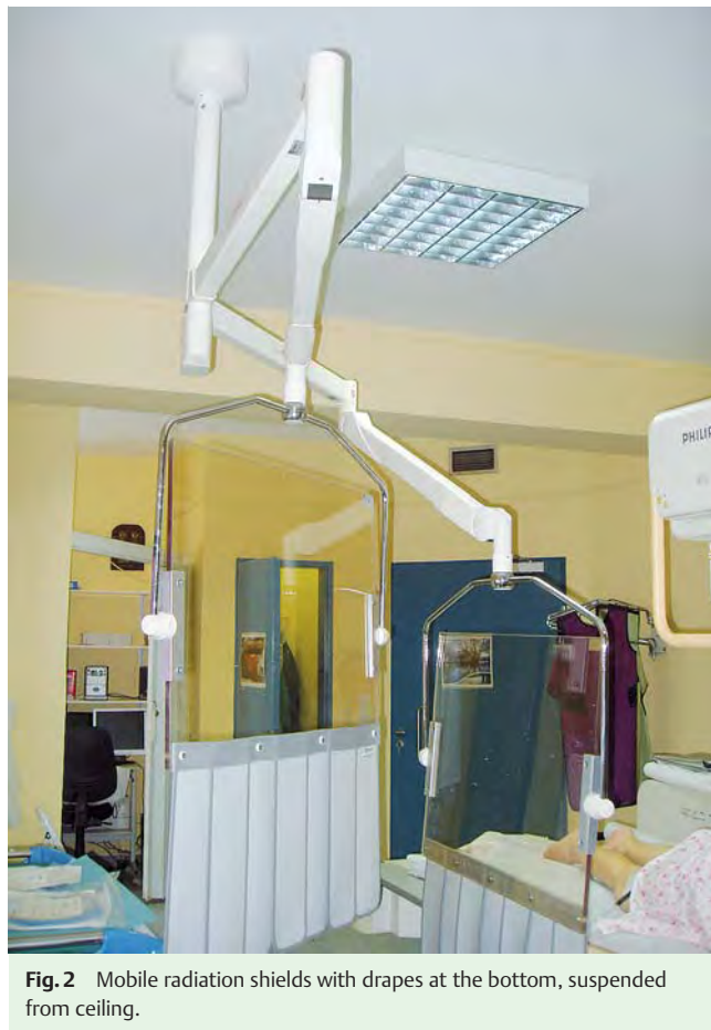
Fig. 2 Mobile radiation shields with drapes at the bottom, suspended from ceiling.

There are no trials available regarding this issue but radiation-warning lights inside and outside the examination room are recommended; they must operate automatically [68]. Regulations